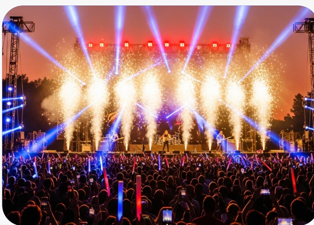
MEDIA & ENTERTAINMENT