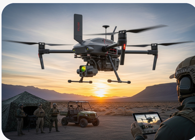
DEFENCE & SECURITY