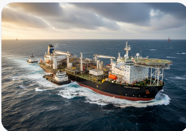
MARITIME & OCEAN EXPLORATION