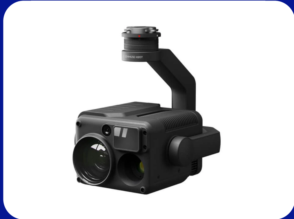
CAMERAS, SENSORS & PAYLOADS