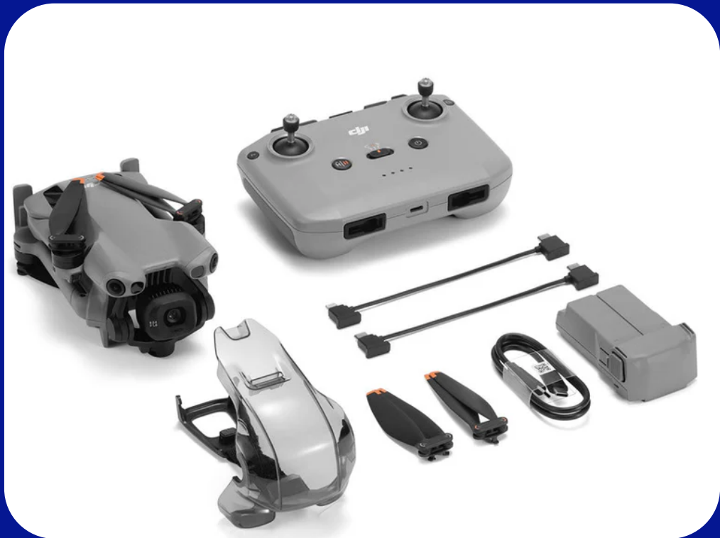
ACCESSORIES & PARTS