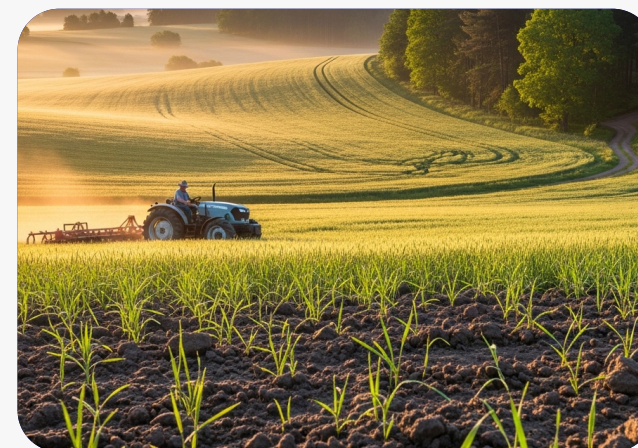
AGRICULTURE & FORESTRY