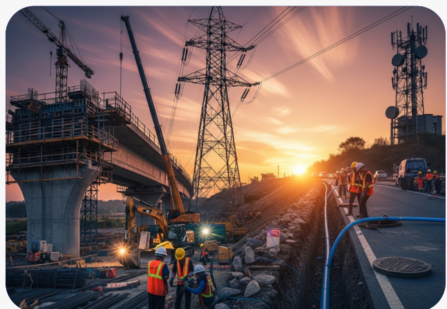
CONSTRUCTION, INFRASTRUCTURE, POWER & TELECOMS